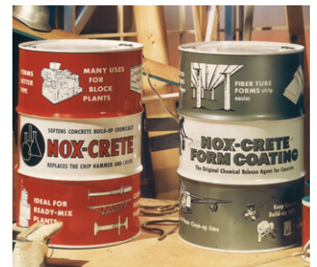
DEACTIVATOR FORM COATING