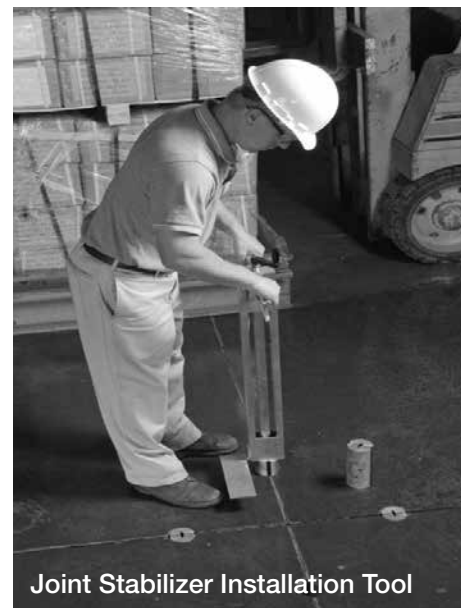
Joint Stabilizer Installation Tool