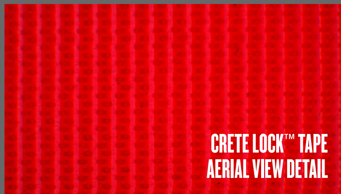
CRETE LOCK™ TAPE AERIAL VIEW DETAIL

CONTACT POLY-AMERICA'S SALES DEPARTMENT WITH QUESTIONS OR FOR PRICING AND LOCAL DISTRIBUTION OPTIONS.