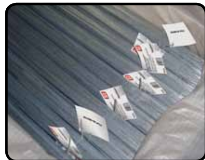
Galvanized Hanger Wire - Pieces/Bundle