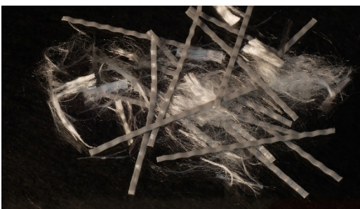
Figure 3- Blended Fibers - SikaFiber® Novomesh®-950

There are also blends of micro and macro fibers (see Figure 3). The blends utilize the crack control of both the micro and macro fibers. In short, fiber blends offer control of cracking that can occur in the first 24 hours of concrete cure (micro fiber) and long-term crack control due to loads (macro fibers).