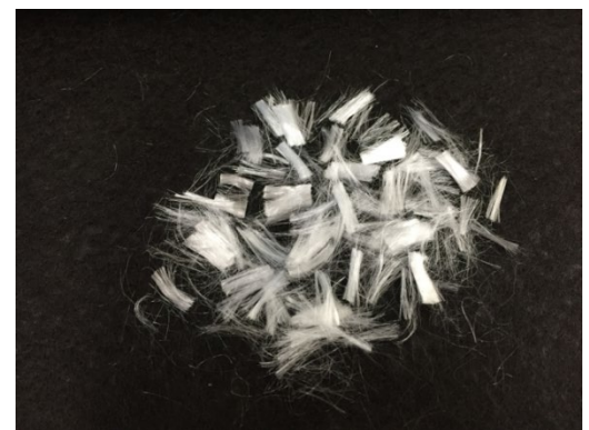
Figure 1 | Micro Fiber - Sika® Fibermesh®-150

Micro fibers (see Figure 1) have a diameter that is less than 0.3mm. Micro fibers are either monofilament or fibrillated. Micro fibers should be used for plastic shrinkage control (cracking that can occur in the first 24 hours of concrete cure), impact protection, and fire explosive spalling protection. Micro fibers are not a structural reinforcing fiber and cannot be used to replace any structural steel elements, except the fibrillated micro fiber can be used to replace the lightest gage wire fabric (6x6 W1.6/W1.6) in slabs on ground.