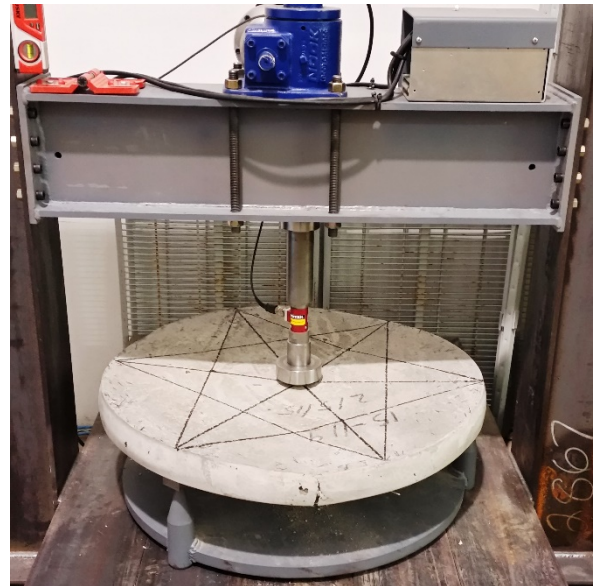
Figure 6 | ASTM C1550 Shotcrete Round Panel Test

Shotcrete Quality Control is measured via post crack energy absorption testing (also called toughness) expressed in Joules. Toughness is tested using the ASTM C1550 Standard Test Method for Flexural Toughness of Fiber Reinforced Concrete (see Figure 6). The test was designed to replicate the typical shotcrete loading conditions. Fiber suppliers should supply documentation from third party testing facilities that their fiber can meet the required joule specification using one of these tests.