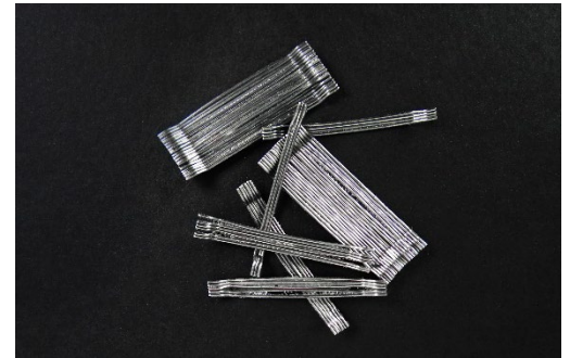
Figure 4 | Collated Steel Fibers - SikaFiber® Novocon® CHE6560

Fibers begin to function in a structural supportive manner when the concrete matrix starts to crack, just like traditional reinforcement. The crack has to occur for the load to switch from the concrete to the reinforcement. Unlike reinforcing bars, fibers are uniformly distributed in the concrete matrix; therefore, the distance between the fibers is much smaller and can intercept the crack much quicker. The fibers then produce ductility and support by bridging cracks and thus providing post crack strength to the concrete.