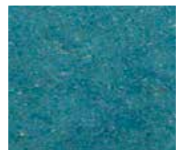
1275 Bahama Blue