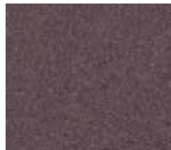
2145 Grecian Gray