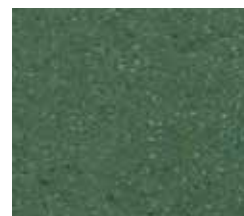
1705 Emerald Green