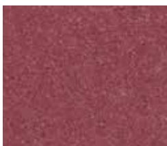
1255 Aztec Red