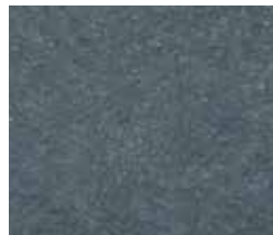
1445 Cold Steel