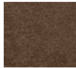
4405 Rustic Bark