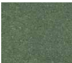
1995 Frost Green