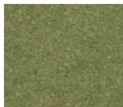
5195 Snow Pea