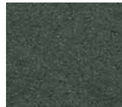
4915 Slash Pine