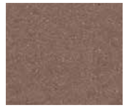
2045 Georgia Clay