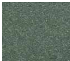
1385 Douglas Fir