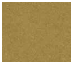
1435 Inca Gold

SCOFIELD® Formula One™ Liquid Dye Concentrate is a penetrating, translucent dye concentrate designed to color interior concrete surfaces prior to being sealed, densified, or polished. It is ideal for use on older interior concrete slabs, slabs where acid stain cannot be used, or areas that must be quickly returned to service. For projects where a natural concrete color is desired, G388 Soft Gray is recommended.