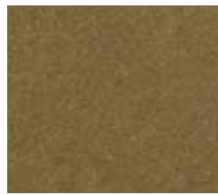
1335 Beach Sand