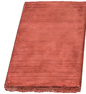
Treated with SikaCem ® -102 First Seal ®