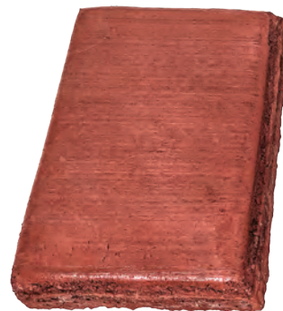
Treated with SikaCem ® -102 First Seal ® + Acrylic Sealer