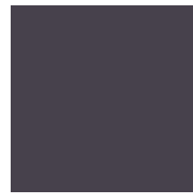
C-34 Dark Gray