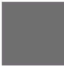
C-284 Landmarks Gray