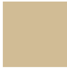
C-235 Autumn Beige