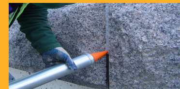
SEALING AND BONDING