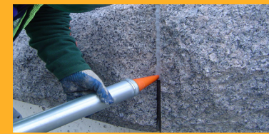
SEALING AND BONDING