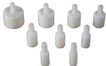
Adhesive Piston Plug Family

The matched tolerance design between the piston plug and drilled hole virtually eliminates the formation of voids and air pockets during adhesive dispensing.