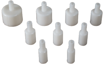
Adhesive Piston Plug Family

The matched tolerance design between the piston plug and drilled hole virtually eliminates the formation of voids and air pockets during adhesive dispensing.