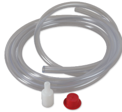
Piston Plug Delivery System