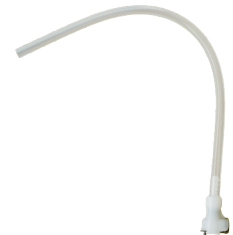
EIF-EZ E-Z-Click injection fitting