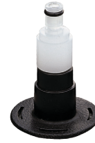
EIP-EZA E-Z-Click flush-mount injection port

For medium to large jobs, material cost can be reduced through buying in bulk. The 3-gallon bulk kits can be dispensed through metered bulk injection equipment supplied by others.