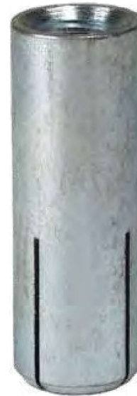
Drop-In Stainless Steel