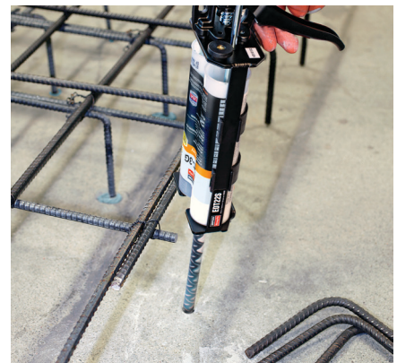
ET-3G Rebar Installation