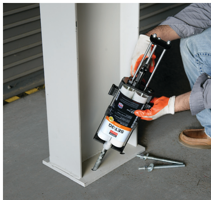
SET-3G — Column Installation