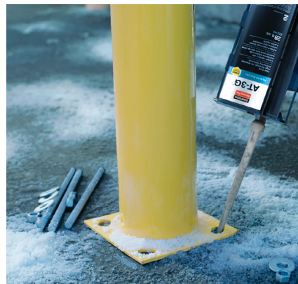
AT-3G Threaded Rod — Post Installation