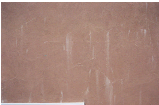
Photo 1: Cracks that are dispersed across a large area can be repaired with elastomeric coating if narrow in width (1/32" or less), Procedure A, or with glass fiber reinforcing mesh and acrylic base coat, Procedure B. Surface cleaning to remove the efflorescence and any other surface contamination must be done first.