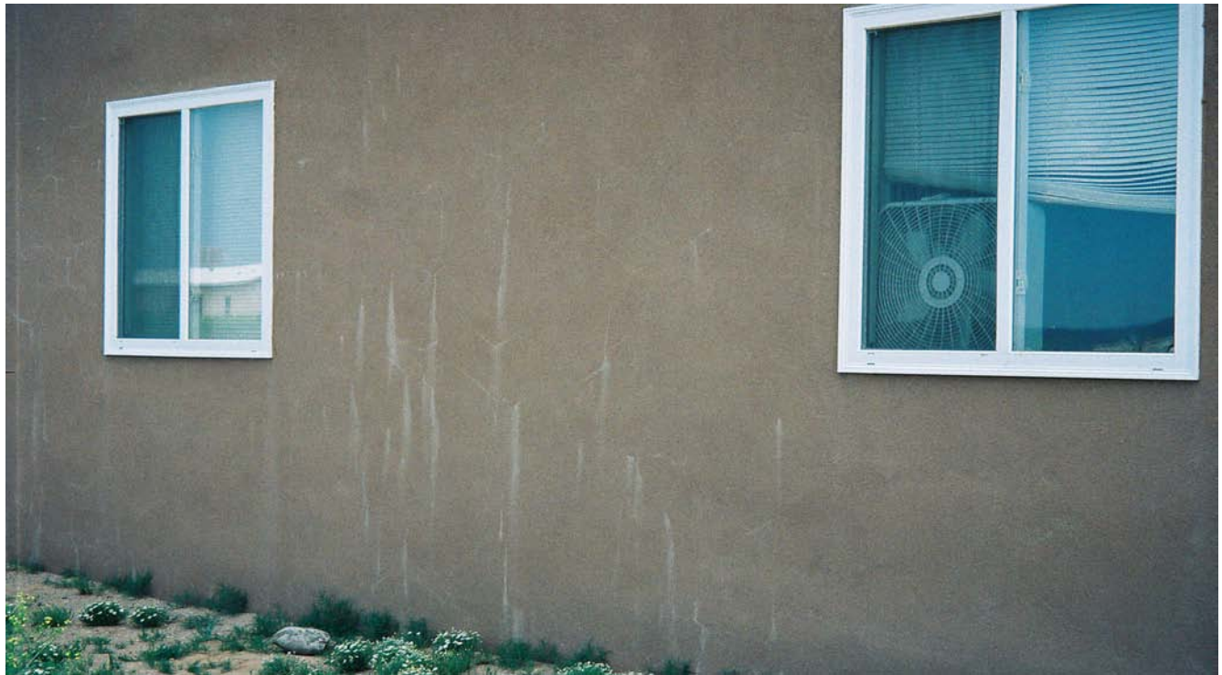
Photo 1: Efflorescence can be cleaned with a mild acid solution to remove unsightly stains on the exterior surface of the stucco.

Efflorescence can generally be removed by light washing with a cleaning agent. A common household solution is vinegar and warm water. Proprietary cleansers 1 are also available from a number of different sources (see notes below). Care should be taken to avoid heavy abrasion of the surface which could damage the integrity of the textured material. A soft bristle scrub brush should be used to scrub the affected area with the cleaning solution. Always try a small inconspicuous area first to be sure of desired results. When using proprietary cleansers follow the instructions and safety precautions on the packaging.