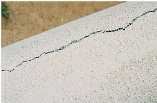
Photo 1: the large crack in the parapet requires elastomeric crack filler, followed by waterproofing with glass fiber mesh installed around the parapet and a minimum of 6" down each side.