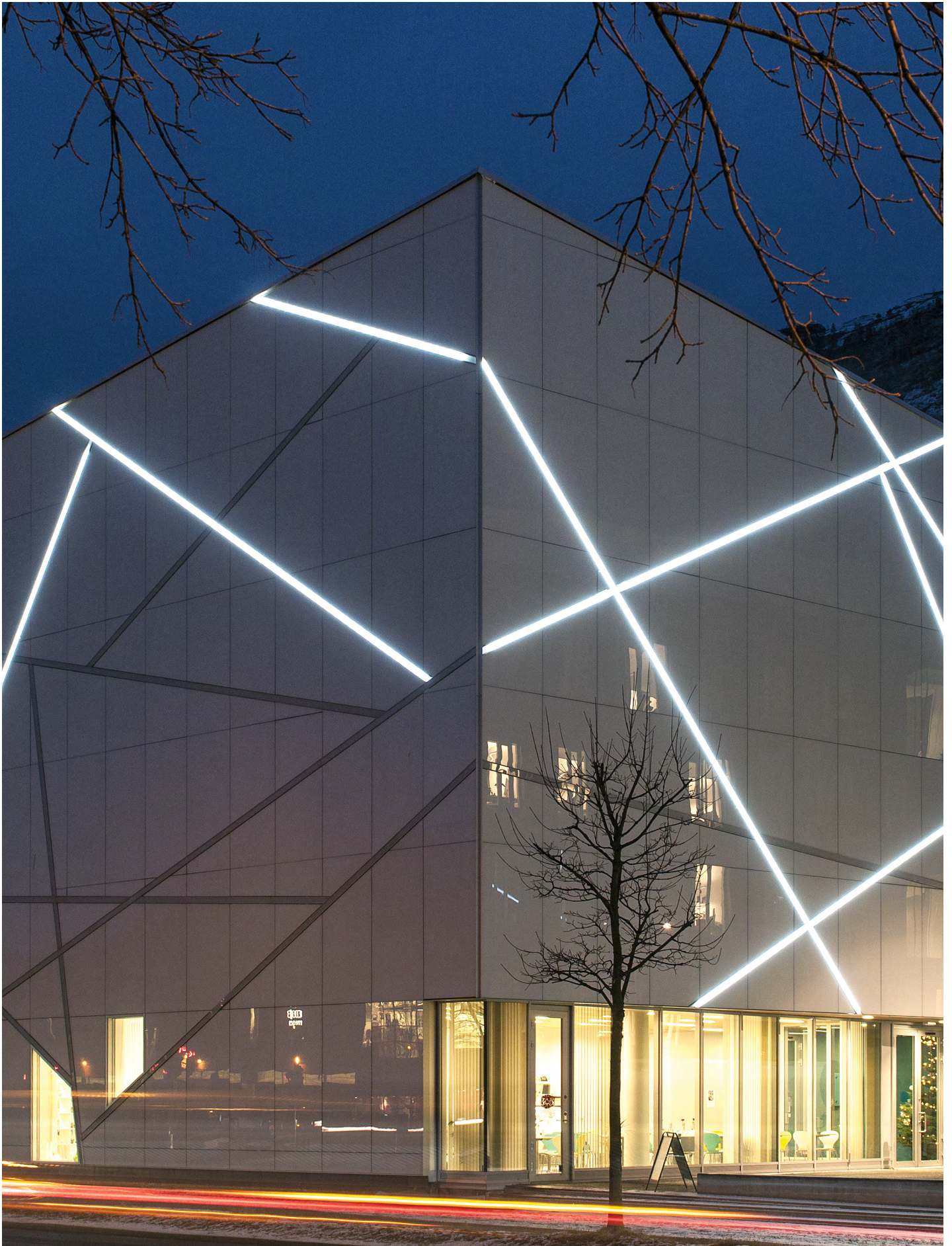
Sogn og Fjordane Kunstmuseum | Norway