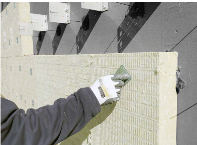
Sto AirSeal - shown in charcoal

It all comes down to performance. In addition to all of the fire, mechanical and water resistance testing required for North American code compliance, StoVentec Glass has passed ISO 16933 blast testing requirements that simulate a car bomb-size explosive detonating 15m away. This is performance you can trust.