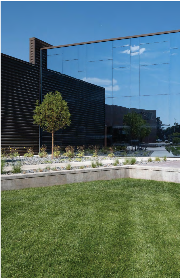
Innovation Outpost | Texas

You will receive a tailored system, with StoVentec Glass Panels manufactured specifically for your project. Sub-construction, air & water-resistive barrier, insulation and cladding all designed to work together, engineered and tested as a complete system.