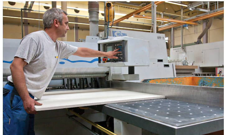
To the millimetre: StoVentec Glass panels are cut to their individual format