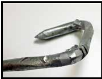
Competitor's Galvanized Nail