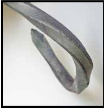
Genuine Tree Island Steel Hot-Dipped Galvanized ZincGard® Nail