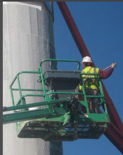
ExoAir® 230/230 LT